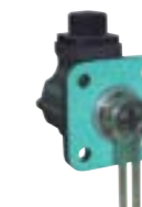
EF 67/2.50.16 a,b,ac