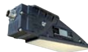
Radar sensor Doppler radar dual antenna system

DEUTA offers you three groups of sensors which differ in their measuring principle: