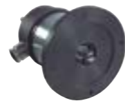
EF 66.50.16 e, f, m AC voltage generator