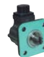
EF 67/2.20.16 a,b