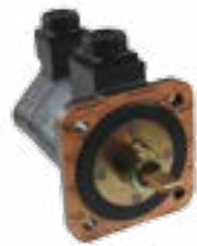
EFI 61/2S1 a,ad