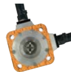
Axle-mounted sensors 1- to 4-channel pulse generator

Feature an extremely long service life because the space-saving sensors operate contactless and therefore with low wear.