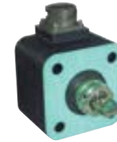
DF 17/1 a, ac, ad, b