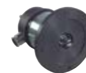
EF 66.50.16 e,f,m