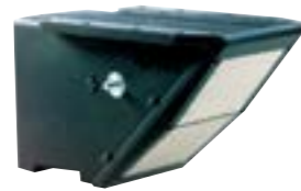
DRS 5/1 a