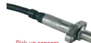
Pick-up sensors Hall sensor

The sensors operate contactless and measure the speed and distance over the ground by deploying the Doppler principle with a patented antenna layout. The integrated digital signal processor performs sophisticated evaluation algorithms in the device.