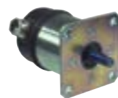
EF 66.20.16 n, nf, nh