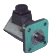
EFI 67/1.20.16 a, ac, ad