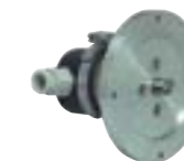
EF 83.20.12 m, n