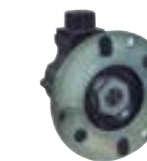
EF 67/2.50.16 ad, ae