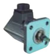
EFI 67/1.50.16 a, b, ac, ad, ae