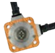
DF 16/1 a, ac 1- to 4-channel pulse generator