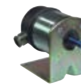
EF 66.50.16 n, nw,i