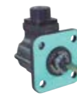
EF 67/2.20.16 ad, ae