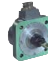
DF 16/1 a, ac, ad, af, nf

All axle-mounted sensors can be supplied as multi-channel units. They can be customised to a certain extent with regard to the number of pulses, the phase relationships, and the output circuits.