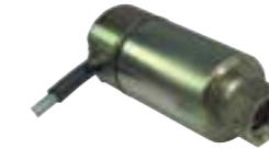
EFK 84.20.8 a EFK 84.20.12 a