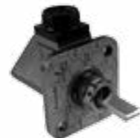
EFI 501S1 a,d